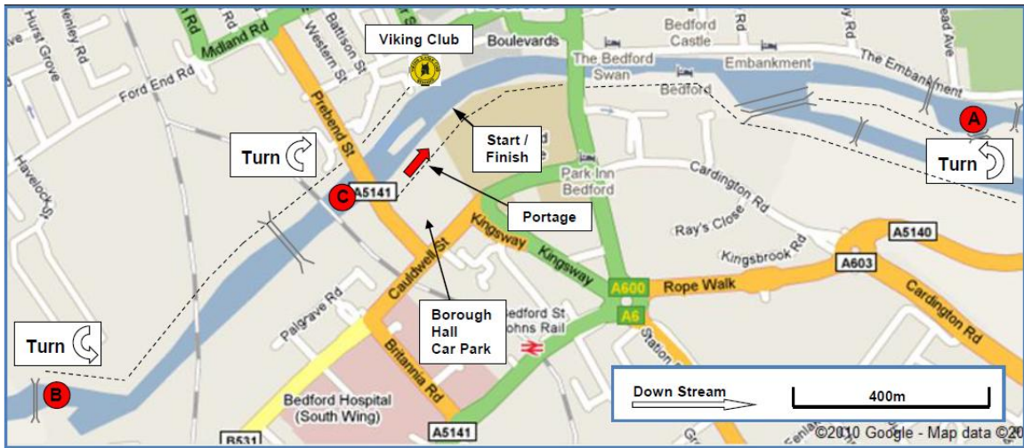
Figure 1 - Event Location Plan